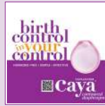
Patient quick-info brochure