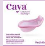
Caya IFU brochure

Our FREE Caya EduCare Kit simplifies the process of teaching your patients about Caya. Each purple box has everything you need to: